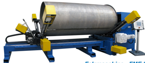
Falzmaschine - FME 8

Prinzing Maschinenbau have recently launched a new heavy duty pipe flanger.