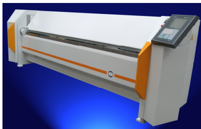
RAS TURBObend Plus

Heys-Shaw/Versasteel bought a package of a RAS 62.30 TURBObend Plus CNC Folder and RAS 52.30 SMARTcut Shear . These were from an Irish company who had decided to stop production in view of the serious recession over there.