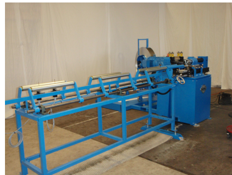
New SMART Tubeformer

We were involved with Spiro for many years back in the 80's and early 90's. They are world leaders in the design & supply of high quality circular duct machinery and are owned by Lindab.